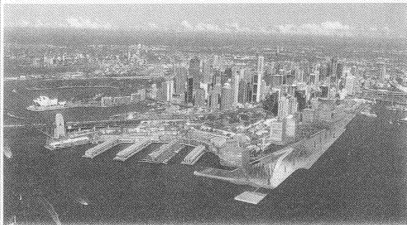
FIG. 3 East Darling Harbor, Sydney, Australia, 2005; aerial view of new waterfront urban development as an exotic topographical landscape

to “landscape.” Gruen’s “cityscape” refers to the built environment of buildings, paved surfaces, and infrastructures. These are further subdivided into “technoscapes,” “transportation-scapes,” “suburb-scapes,” and even “subcityscapes”—the peripheral strips and debris that Gruen calls the “scourge of the metropolis.” On the other hand, “landscape,” for Gruen, refers to the “environment in which nature is predominant.” He does say that landscape is not the “natural environment” per se, as in untouched wilderness, but to those regions where human occupation has shaped the land and its natural processes in an intimate and reciprocal way. He cites agrarian and rural situations as examples, invoking an image of topographic and ecological harmony, bathed in green vegetation and clear blue sky. For Gruen, cityscape and landscape were once clearly separated, but today the city has broken its walls to subsume and homogenize its surrounding landscape in an economic and “technological blitzkrieg”—the various “scapes” now in conflict and with boundless definition.