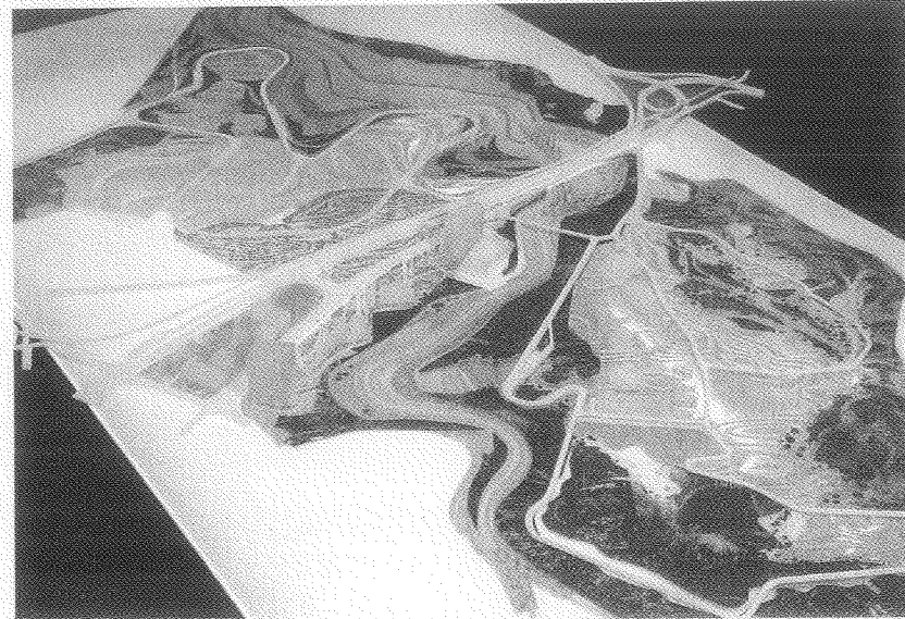
FIG. 4 Botanical Garden of Puerto Rico, San Juan, 2004: site plan depicting the garden as a new hybridized form, conjoining urban programs, research, technology, and information with nature, open space, and rain forest

In comparing the formal determinism of modernist urban planning and the more recent rise of neo-traditional "New Urbanism," the cultural geographer David Harvey has written that both projects fail because of their presumption that spatial order can control history and process. Harvey argues that "the struggle" for designers and planners lies not with spatial form and aesthetic appearances alone but with the advancement of "more socially just, politically emancipatory, and ecologically sane mix(es) of spatio-temporal production processes," rather than the capitulation to those processes "imposed by uncontrolled capital accumulation, backed by class privilege and gross inequalities of